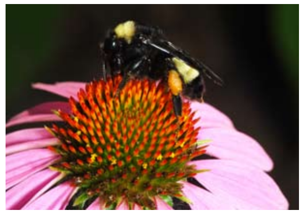
Bombus pensylvanicus © Edward Spevak

The Saint Louis Zoo hosted an IUCN North American Bumble Bee Species Conservation Strategy Workshop on 9-12 November. A broad coalition of stakeholders concerned with the survival of North American bumble bees participated, including relevant US government agencies, Biobest and Koppert (the two major commercial breeders of bumble bees for agricultural production),