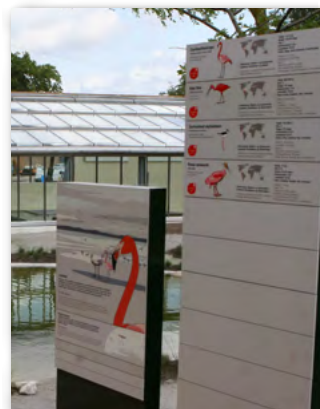
Copenhagen Zoo, Denmark