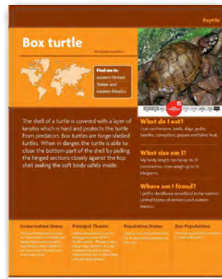
Belfast City Zoo, Northern Ireland