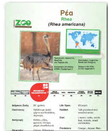
Limassol Zoo, Cyprus