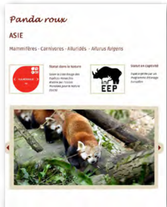
BIOPARC de Doué la Fontaine, France