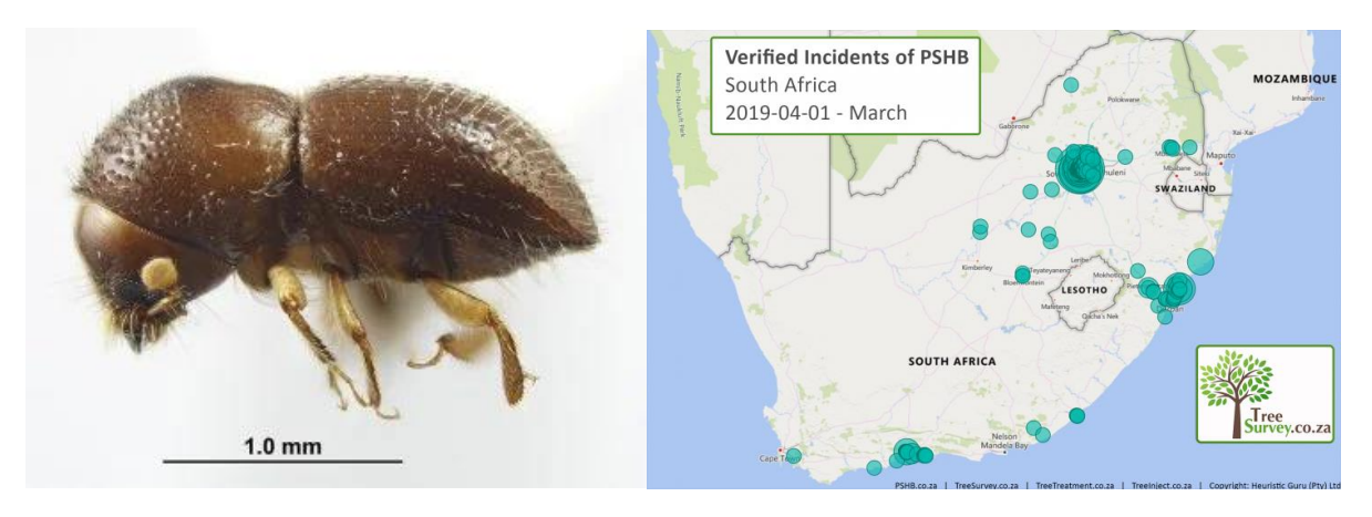
Figure 3. The Polyphagous shot hole borer and its current distribution in South Africa.

It has spread rapidly and is found in many of the major cities in South Africa including Johannesburg, Pietermaritzburg, Durban, Bloemfontein, Ekurhuleni, as well as George and Knysna (Figure 3). A total of 21 tree species have been identified as being reproductive hosts to the PSHB, and there is evidence of infestation from a further 151 tree species in South Africa (Fryer 2019). Species lists from KZN and Gauteng revealed that 43% of the tree species affected by the PSHB are Cape Parrot feeding tree species, including Real Yellowwood Podocarpus latifoleus , Cape Chestnut Calodendron capense and Wild Plum Harpephyllum caffrum (Fryer 2019). Methods of eradication are being developed, and include the use of nanotechnology in the form of an Amphiphilic Nano Oil Delivery System (ANODS) to carry a naturally occurring fungicide through the bark and trunk to target the fungus, causing no harm to the trees themselves (Watson 2019).